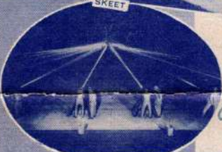
NIGHT TRACER FIRING