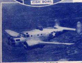
TURRET AIR FIRING