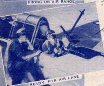
READY FOR AIR LANE