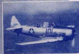
FIRING ON AIR RANGE